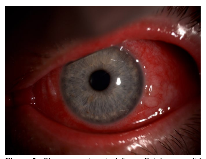
Figure 2: Pharyngoconjunctival fever: Epiphora, eyelid swelling, burning, chemosis, conjunctival hyperemia, subconjunctival hemorrhage.

Adenoviral conjunctivitis is a self-limited disease that usually resolves completely within three weeks. Conservative treatments, including artificial lubricants and cool packs, can provide efficient symptomatic relief without any adverse effects. Topical antibiotics are utilized to treat or prevent bacterial superinfection.<sup>4</sup> Topical antihistamine eye drops and vasoconstrictors also reduce discomfort and duration of disease despite the risk of local toxicity.<sup>5</sup> The use of topical steroids is controversial. Topical steroids are frequently given in the acute phase, although this only has a temporary alleviating effect. The disease and infection durations could be prolonged due to increased adenovirus replication rate and extended viral shedding as demonstrated in animal models. Steroid treatment should be limited to complicated cases with pseudomembranes or subepithelial infiltrates where visual acuity is significantly reduced. Topical nonsteroidal anti-inflammatory drugs are also ineffective in controlling adenovirus replication in animal models.<sup>6</sup> Although nonsteroidal anti-inflammatory drugs have no significant effect on the subepithelial infiltrates, they may be a safer alternative to topical steroids for symptomatic relief. Virustatic agents such as vidarabine, trifluridine and ganciclovir are only mildly effective against adenovirus, and current data with regard to their efficacy in treating adenoviral conjunctivitis remains controversial.7