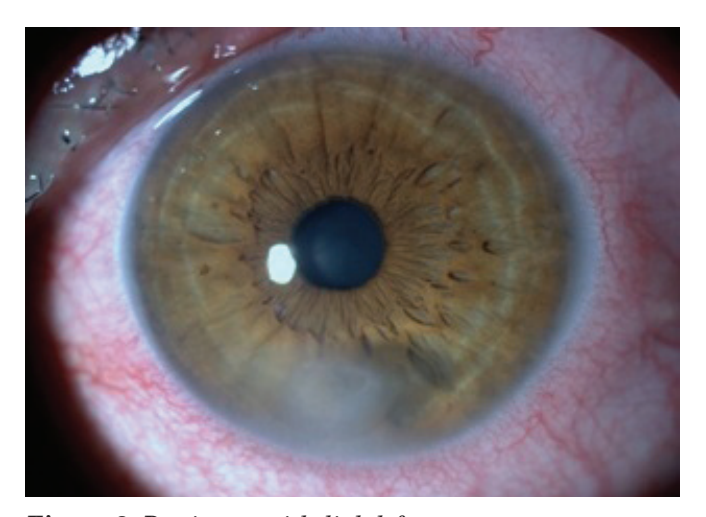
Figure 2: Persistent epithelial defect.

EGFR inhibitors can be split in 2 groups concerning the site of inhibition and their molecular weights. High molecular weight EGFR inhibitors act in an extracellular binding site (panitumumab), and low molecular weight EGFR inhibitors act in an intracellular binding site (erlotinib). EGFR is expressed in basal epithelial cells and is believed to be responsible for limbal epithelial mitosis during corneal epithelial cell proliferation.