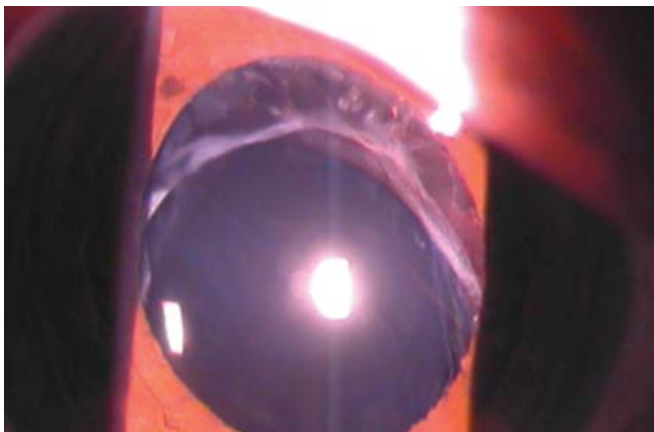
Figure 1: Clinical photograph of IOL in the right eye decentrated inferiorly and temporally, and the pseudoexfoliative material on anterior capsule.