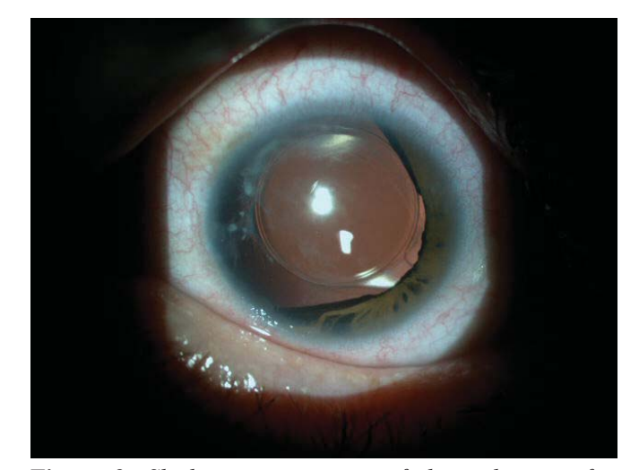
Figure 3. Slit-lamp examination of the right eye after phaco+IOL surgery; partial aniridia and ectropion uvea. IOL is centralized.

MVR knife was used to fashion a small paracentesis at the peripheral cornea, Intracameral injections of tripan blue dye (with the air support) was performed after the side ports were made and capsule had been visible. Anterior chamber was washed with balanced salt solution (BSS) and dispersive viscoelastic (Viscoat) was injected. Hydrodissection was performed carefully. Phacoemulsification was performed by stop and chop technique. We detected zonular weakness at